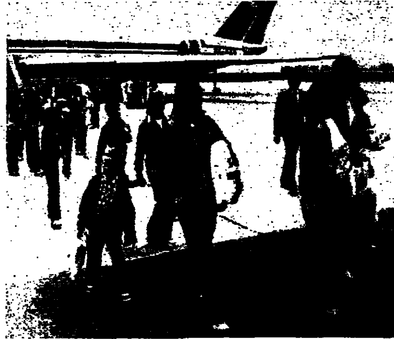
A group of Czechoslovak citizens, 21 children, 17 women and seven men, released by the anti-government organization UNITA in Angola, arrive in Prague on Friday.

CAIRO (Reuters). — The Egyptian government was accused by the press yesterday of misleading the public about an outbreak of cholera which has so far killed four people and stricken hundreds more. The government has not acknowledged an outbreak of cholera last week at Saft el-Laban, a village 10 kms west of Cairo, but has launched a nationwide health campaign which appeals to people through the media to submit themselves to cholera vaccination. "The Ministry of Health has undertaken a campaign against 'summer diseases,' an editorial in the English-language Egyptian Mail said, quoting the euphemism by which government officials refer to cholera cases. "But what are summer diseases? The public has a right to know exactly what the present summer diseases are and what health risks they involve," the paper said. Later on Friday, the Egyptian police admitted that there had been a cholera outbreak, caused by the seepage of sewage into the drinking water system. Some 800 cases were isolated at the El-Laban hospital near Cairo, it was added.